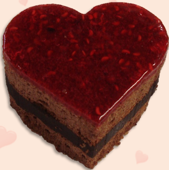
52841 Himbeer Choco Herz